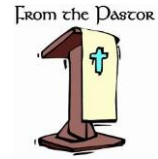
FROM THE PASTOR