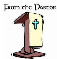
From the Pastor