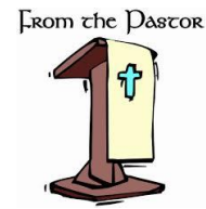
From the Pastor