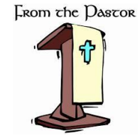
From the Pastor