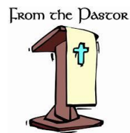
From the Pastor