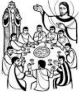
"Come to the Feast"