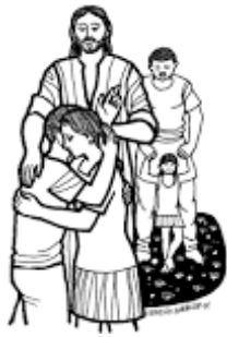
The Commandments of GOD are Commandments of LOVE.